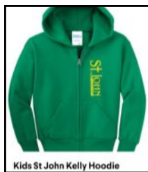
Kids St John Kelly Hoodie