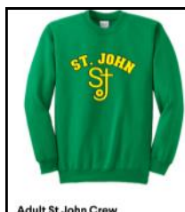
Adult St John Crew