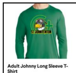
Adult Johnny Long Sleeve T-Shirt