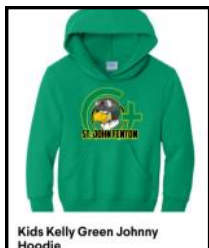
Kids Kelly Green Johnny Hoodie