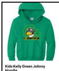
Kids Kelly Green Johnny Hoodie