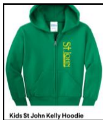
Kids St John Kelly Hoodie