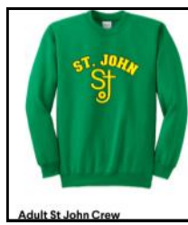
Adult St John Crew