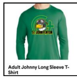
Adult Johnny Long Sleeve T-Shirt