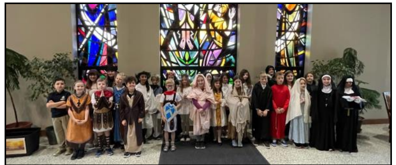
Our 4th grade Saints