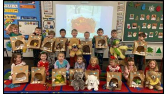
"Hibernation Day" in preschool